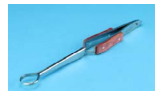
AR766 Crucible Tweezers