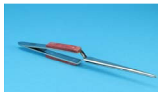
AR138 Sample Tweezers