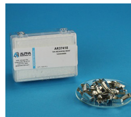
Tin Boat (12 x 4 x 4mm) AR37418 (200014577/22 137 418)