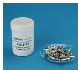
Smooth Wall Tin Capsules, Flat Base (9 x 3.5mm) AED4132 (200015479/03 951 619)