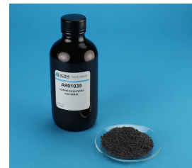
Copper Oxide Wire, Fine Wires AR01039 (200009554/05 001 039)