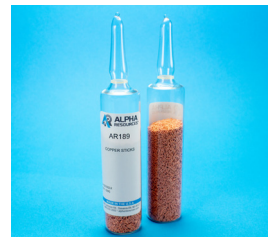
Copper Sticks AR189 (200014271/05 000 699)