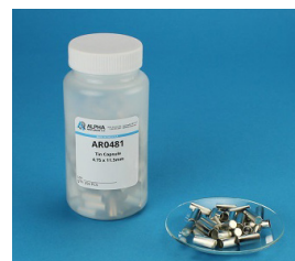
Pressed Tin Capsules (11.5 x 4.75mm) AR0481 (200008184/05 000 481)