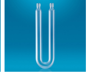
U Tube (195mm) AR01032 (200005812/22 160 301/4)