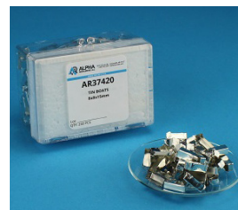
Tin Boat (15 x 8 x 8mm) AR37420 (200012350/22 137 420)