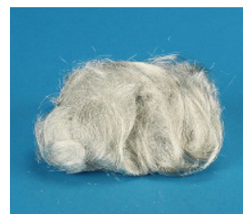
Silver Wool, Fine Wire (.05mm) AR22365 (200005872/22 131 365)