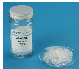
Quartz Chips, Turnings (2-5mm) AR00900 (200007521/05 000 900)