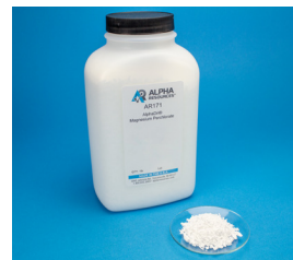
Alphadri® Magnesium Perchlorate - Nominal Mesh Size 10-20 (HMA HMG) AR171 (03 679 901)