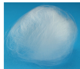
Quartz Wool, Fine (9 Micron) AR177 (200004827/03 679 908)