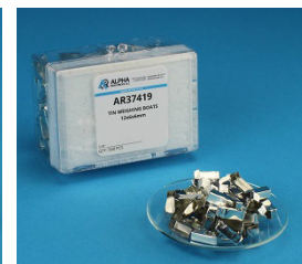
Tin Boat (12 x 6 x 6mm) AR37419 (200007074/22 137 419)