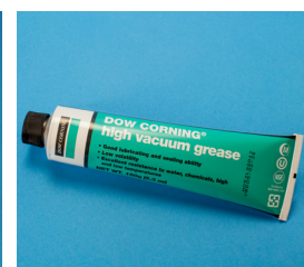
Silicone Grease AR241