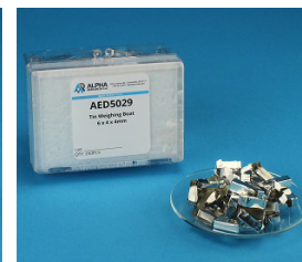
Tin Sample Boats (6 x 4 x 4mm) AED5029 (200007543/11.02-1047)