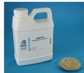
AlphaSolve® II (20-30 Mesh) AR2174 (200011868/03 679 900)