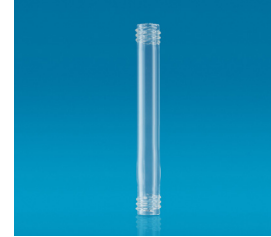
Drying Tube AEC3008