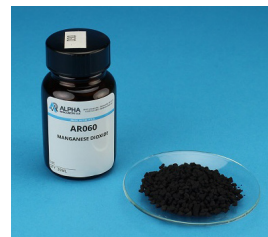
Manganese Dioxide AR060 (05 000 880)