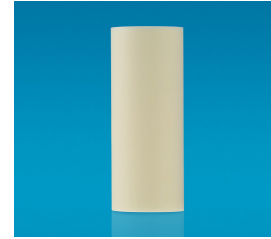
Ash Finger AR00087 (200006734/05 000 087)