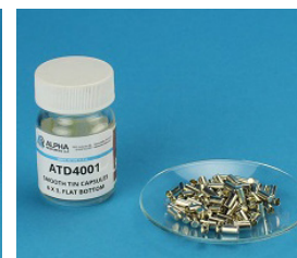
Smooth Wall Tin Capsules (6 x 3mm) ATD4001