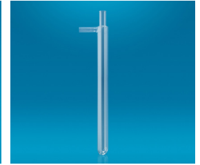
Combustion Tube AEC3004