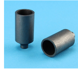
Graphite Crucible (1.25" x 0.625") AR619 (619-895)