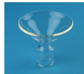
Utility Funnel AR473 (502-023)