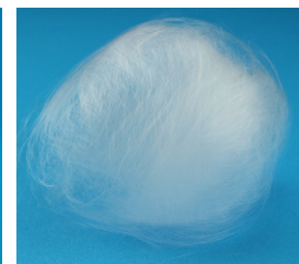
Glass Wool AR081 (501-081)