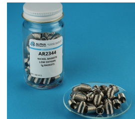
1.0g Nickel Basket, Ultra High Purity AR2344 (502-344)