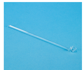
Regular Glass Scoop (0.14cc) AR901 (503-032)