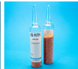
Copper Sticks AR189 (502-705)