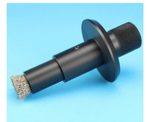
Complete Electrode Cleaning Brush AR11182 (625-711-182)