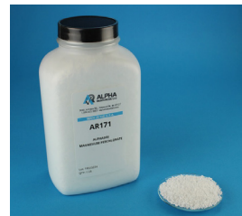
Alphadri® Magnesium Perchlorate - Nominal Mesh Size 10-20 (HMA HMG) AR171 (501-171-HAZ)