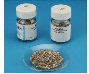
Short Nibbled Nickel Accelerator, Low Oxygen AR598 (501-598)