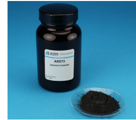
Graphite Powder AR073 (501-073)