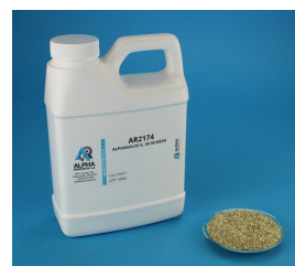
AlphaSolve® II (20-30 Mesh) HAZMAT AR2174 (502-174-HAZ)