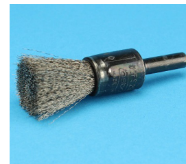
Electrode Cleaning Brush AR652 (774-652)