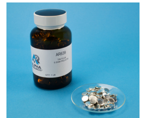
Tin Flux Pellets (0.5g each) AR639 (761-739)