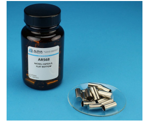
Smooth Wall Nickel Capsule (14.5 x 7mm) Flat Bottom AR568 (502-822)