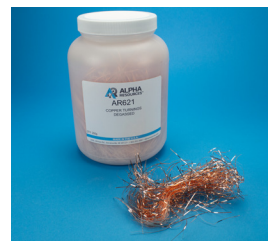
Copper Turnings, Degassed AR621 (502-995)