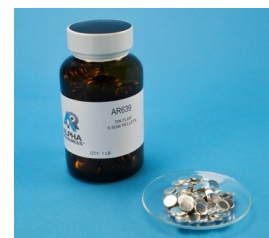
Tin Flux (0.5g pellets) AR639 (90251)