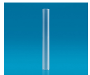
ELTRA Reagent Tube (160 X 16mm) AR11062 (11062)