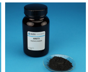
Graphite Powder AR073 (90800)