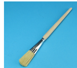
ELTRA Cleaning Brush For Pedestal AR71010 (71010)