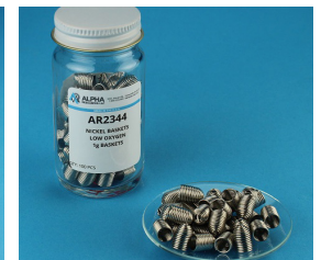
Nickel Basket, (1g baskets) AR2344 (90250)