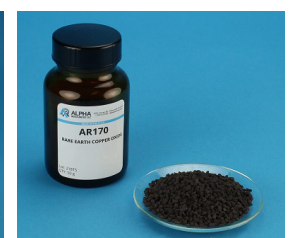
Rare Earth Copper Oxide AR170 (90289)