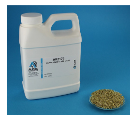
AlphaSolve® II (8-20 Mesh) HAZMAT AR2176 (90210)