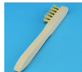
ELTRA Cleaning Brush AR14072B (71031)