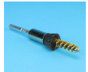
Composite Brush AR938 (71032)