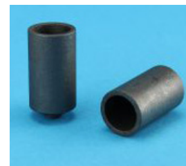
Graphite Crucible (0.955" x 0.50") AR053HD (88400-0491)

Excellent for all applications plus high melting point applications like titanium and zirconium