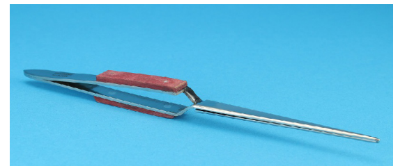
Tweezer, Straight, Self-Closing AR138 (88400-0472)