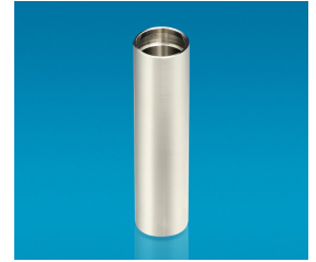
Stainless Steel Ash Finger 90mm AEC3062 (200008114/11.45-1005/4)