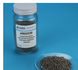
Tungsten Metal AR02530 (200010974/12.00-0040)