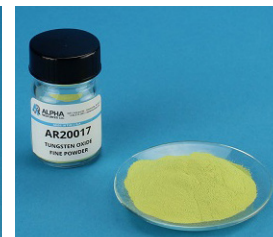
Tungsten Oxide, Fine Powder AR20017 (200009890/11.02-0017)