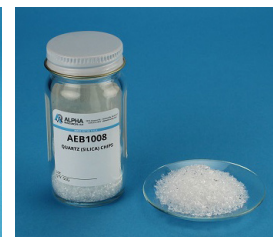
Quartz (Silica) Chips (0.85 - 1.7mm) AEB1008 (200008269/03 679 907)