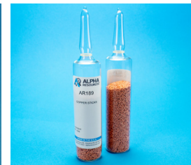
Copper Sticks AR189 (200014271/05 000 699)