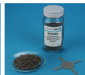
Tungsten Kit AR02530X (200010174/12.01-0045)