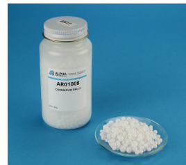
Corundum Balls AR01008 (200010245/50 008 467)