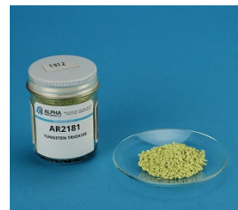
Tungsten Trioxide AR2181 (200008986/11.02-0008)