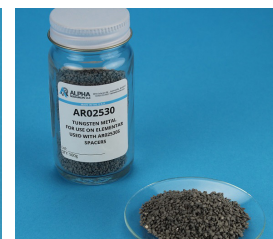
Tungsten Metal For Use On Elementar Analyzers AR02530 (200010974/12.00-0040)