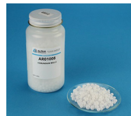
Corundum Balls AR01008 (200010245/50 008 467)