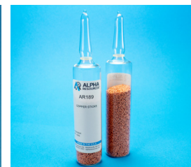
Copper Sticks AR189 (200014796/38.00-1290)