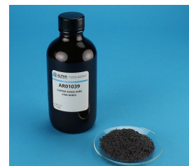
Copper Oxide Wires, Fine Wires AR01039 (200009554/05 001 039)