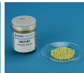
Tungsten Trioxide AR2181 (200008986/11.02-0008)