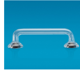
Connecting Tube Trasparent Silica Includes O-rings AR13314 (200004147/11.00-1331/4)