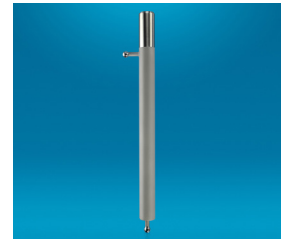
Combustion Tube Stainless Steel, vario MAX AR01030 (200014722/25.00-1030)