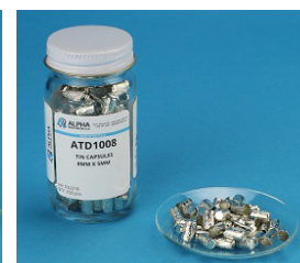
Pressed Tin Capsule (8 x 5mm, WGT=31mg) ATD1008 (200009172/05 003 394)