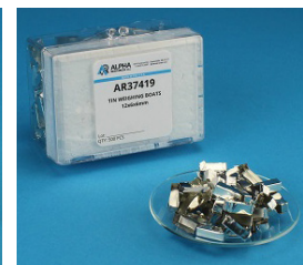
Tin Weighing Boats (12 x 6 x 6mm) AR37419 (200007074/22 137 419)