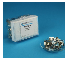
Sample Boats (9 x 10 x 20mm) AR01009 (200006296/12.00-1009)