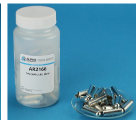
Smooth Wall Tin Capsule (18 x 6mm) AR2166 (200011997/05 000 311)