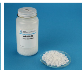
Corundum Balls AR01008 (200010245/50 008 467)