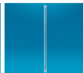
Drying Tube AEC1143 (200008714/15.00-0080)