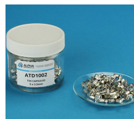
Pressed Tin Capsule (5 x 3.5mm, WGT=13mg) ATD1002 (200006523/05 003 395)