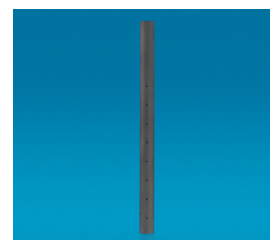
Ash Crucible, Graphite AEC3061 (200006728/23.00-1189)