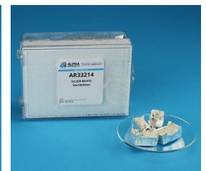
Silver Sample Boats (20 x 10 x 9mm) AR33214 (200010913/22 133 214)