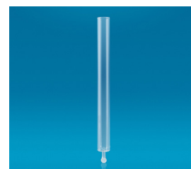
Reaction Tube, Pyrocube AR01149 (200015370/23.00-1149)