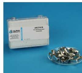
Tin Weighing Boat (12 x 4 x 4mm) AR37418 (200014577/22 137 418)