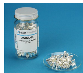
Pressed Silver Capsule (8 x 5mm) ASD2008 (200014521/05 001 540)