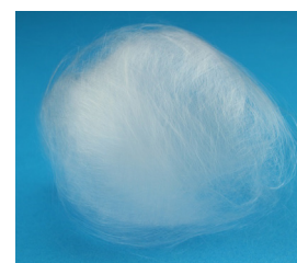
Quartz Wool, Fine (9 Micron) AR177 (200004827/03 679 908)