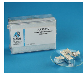
Silver Sample Boats (12 x 6 x 6mm) AR33212 (200007754/22 133 212)