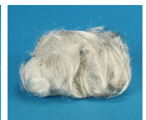
Silver Wool, Fine Wire (.05mm) AR22365 (200005872/22 131 365)