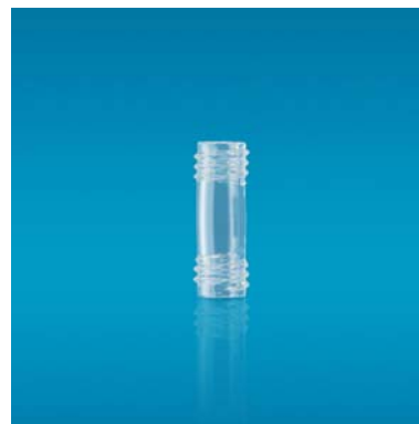
AEC3045 Threaded Filter Tube