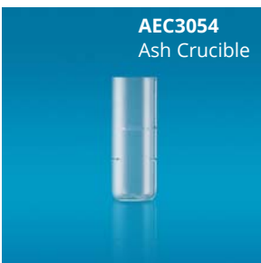
AEC3054 Ash Crucible