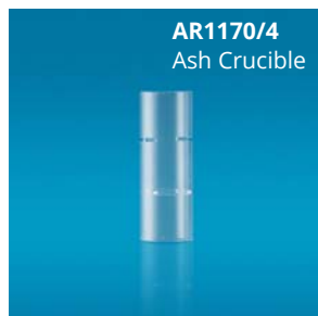
AR1170/4 Ash Crucible