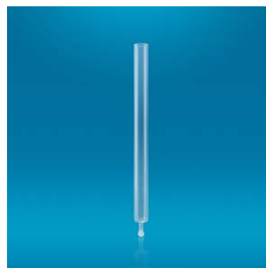
AR11504 Quartz Combustion/ Reduction Tube