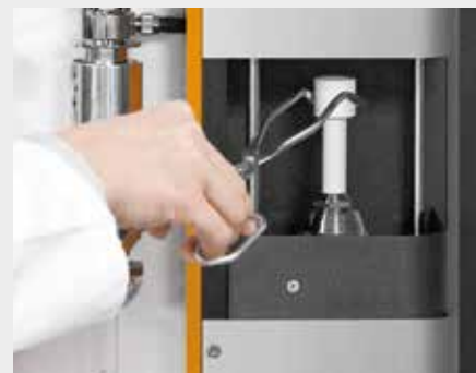
Introducing the sample