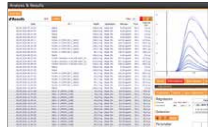
Analysis results after 120-180 seconds