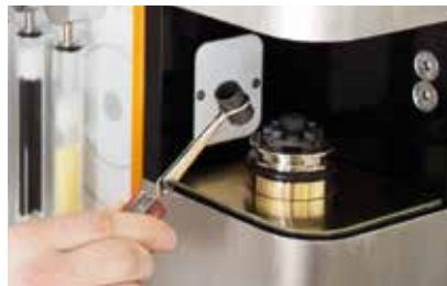
Placing the crucible