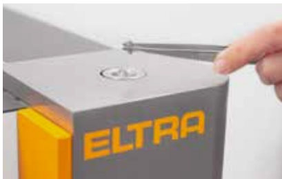
Introducing the sample

All ELTRA analyzers are characterized by their simple operation and quick C/S or O/N/H measurement of powders, granules, wires or foils. After weighing the sample and logging it into the software, all further steps are carried out automatically and the results are provided shortly after the analysis has started.