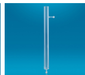
Combustion Tube Quartz AEC3067 (200015419/29.00-1078)