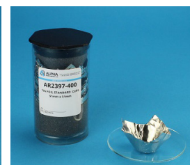
Tin Foil Cups (51 x 51mm) AR2397-400 (200011221/12.01-0033)