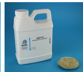
AlphaSolve® II (20-30 Mesh) AR2174 (200011868/03 679 900)