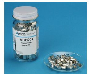
Tin Capsules, Pressed (8 x 5mm) ATD1008 (200009172/05 003 394)