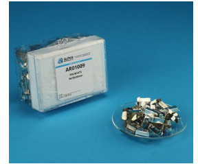
Tin Sample Boats (20 x 10 x 9mm) AR01009 (200006296/12.00-1009)