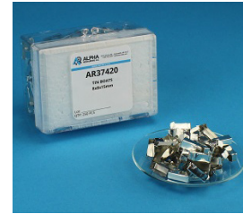
Tin Boats (15 x 8 x 8mm) AR37420 (200012350/22 137 420)