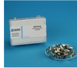
Tin Weighing Boats (12 x 4 x 4mm) AR37418 (200014577/22 137 418)