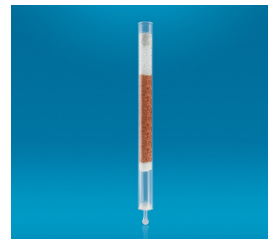
Prepacked CNS/CHNS Reduction Tube Vario EL3 Using C3009 AEX2501 (11.00-1150/4)