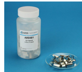
Tin Capsules, Pressed (11.5 x 4.75mm) AR0481 (200008184/05 000 481)