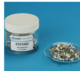
Tin Capsules, Pressed (5 x 3.5mm) ATD1002 (200006523/05 003 395)