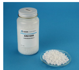
Corundum Balls AR01008 (200010245/50 008 467)