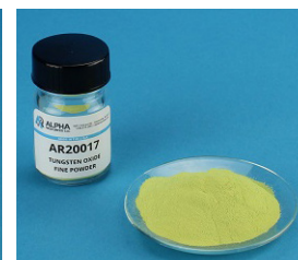
Tungsten Oxide, Fine Powder AR20017 (200009890/11.02-0017)