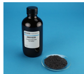
Copper Oxide Wire, Fine Wires AR01039 (200009554/05 001 039)