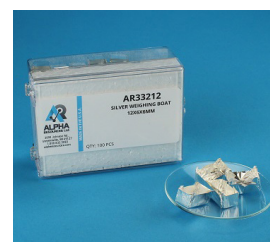
Silver Sample Boats (12 x 6 x 6mm) AR33212 (200007754/22 133 212)