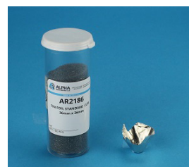
Tin Foil Cups (36 x 36mm) AR2186 (200009010/05 000 429)