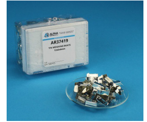
Tin Weighing Boats (12 x 6 x 6mm) AR37419 (200007074/22 137 419)