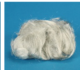
Silver Wool, Fine Wire (.05mm) AR22365 (200005872/22 131 365)