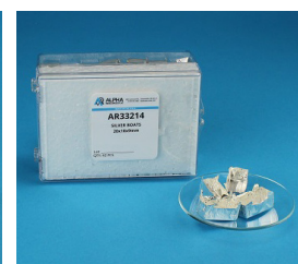
Silver Sample Boats (20 x 10 x 9mm) AR33214 (200010913/22 133 214)