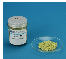
Tungsten Trioxide AR2181 (200008986/11.02-0008)