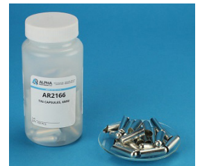
Tin Capsules, Smooth Wall (20 x 8mm) AR2166 (200011997/05 000 311)