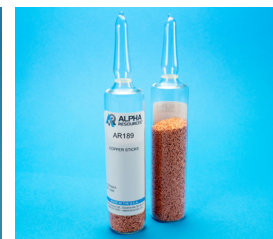
Copper Sticks AR189 (200014271/05 000 699)