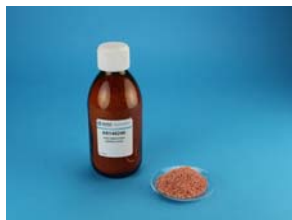
AR140246(14-0246) - 470g High Reduction Copper Sticks