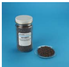
AR140011(14-0011) - 100g HT Combustion Catalyst