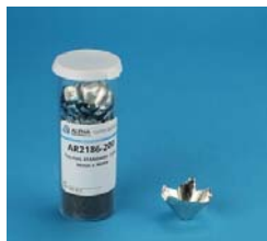
AR2186-200(14-0017) - 200Pcs Tin Foil Cups 36x36mm